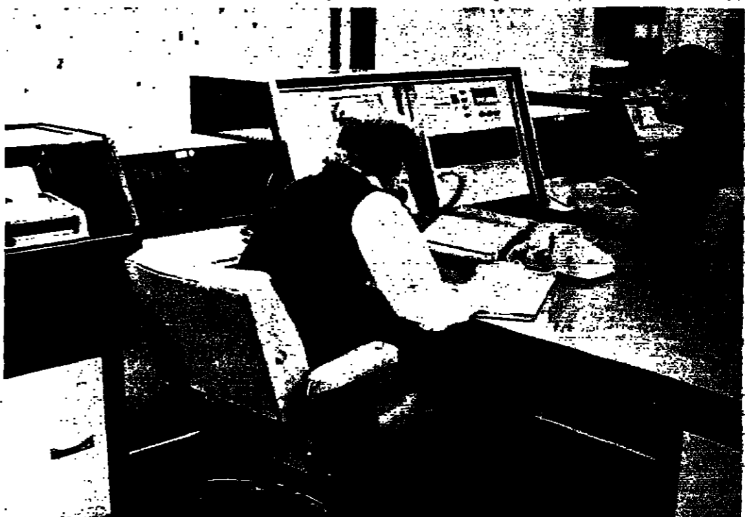
Control centres computerised monitoring devices keep tabs on shipments in transit